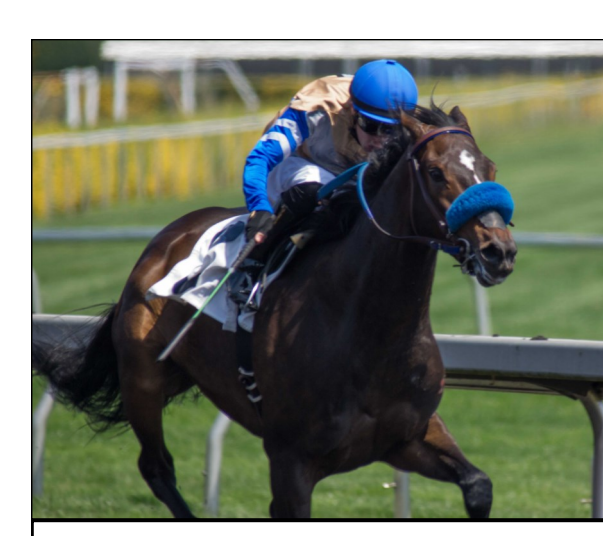
3 yo KY-bred gelding My Discretion , by Discretly Mine, will try his first race on dirt at Emerald Downs after 6 in-the-money finishes in 8 starts on the Tapeta at Golden Gate.

ZTR Horses - Sunpenny, El Mesano, My Discretion, and Lauren's Bluff On-Site