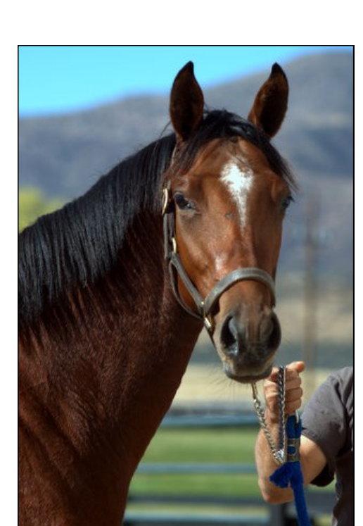
Discreet Miss is by Discreet Cat, sire of stakes-win Discreet Marq, Dads Caps, Air Khalifa, Mama Kimbo, Secret Compass, & Qismah, a millionaire also from the female family of champion Althea.

Lauren's Bluff Offering To debut at Emerald Downs Partnerships Forming Now! Discreet Miss Offering To debut at Golden Gate Fields