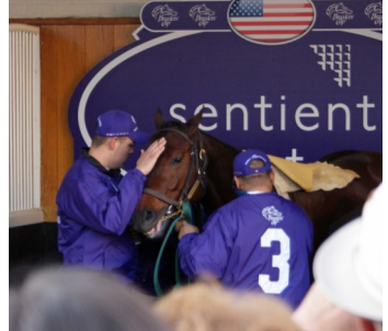
Turbulent Descent being saddled for the 2011 Breeders Cup Filly & Mare Sprint.

"We weren't really asking her for it but it sort of unfolded that way," trainer Todd Pletcher said of the quick breeze. "They went off in 24 and finished in 23. It didn't look like they were going that fast but they did. "It's a positive sign for her," Pletcher added. "She just kind of does what her workmate does