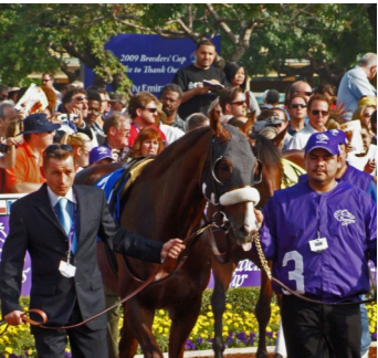
The paddock at Santa Anita Breeders Cup in 2009.

Other BC Entrants include Emerald Downs Champion Class Included