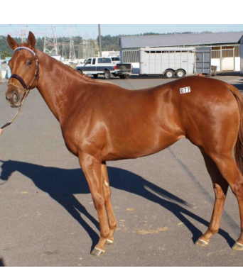
Yearling filly named Sunpenny, is by Good Reward out of stakes winning mare Cascade Corona by Pine Bluff.

Link to Photos of Sunpenny and Mizzen Mast colt