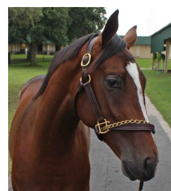
Unnamed Yearling colt by Mizzen Mast out of La Laja by El Prado (IRE).